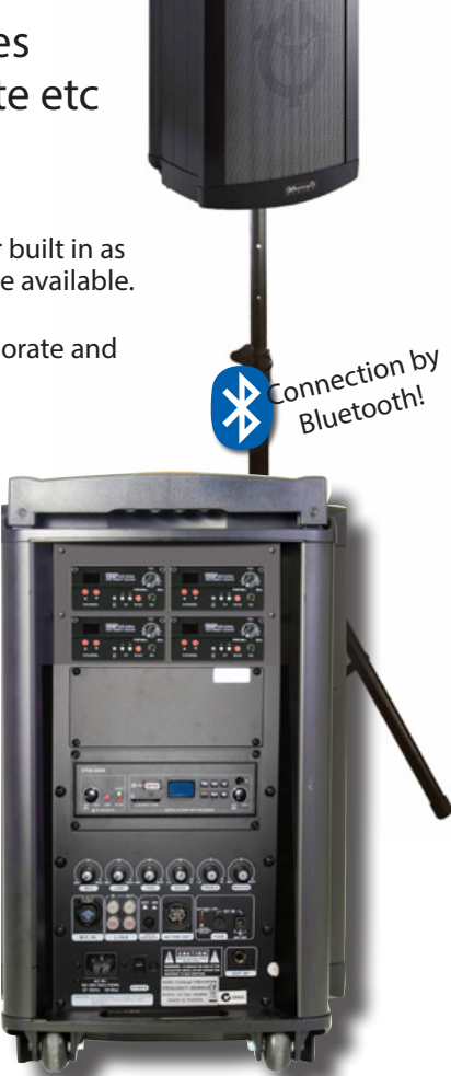
CHALLENGER 1000-D(BD) Shown with four wireless microphone receivers, bluetooth receiver and digital recorder.

Chiayo Portable Sound and Wireless Microphones distributed in New Zealand by Edwards Sound Systems Ltd. 68 Walls Road, Penrose, Auckland, NZ Ph 09 571 0551 sales@edwardsnz.co.nz www.edwardsnz.co.nz